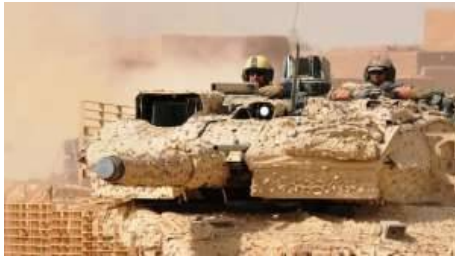
The Attica thermal imaging device from Cassidian Optronics significantly enhances the fighting capabilities of tanks as well as crew safety.

Cassidian Optronics GmbH, previously known as Carl Zeiss Optronics GmbH, will supply the new "Attica" thermal imaging unit for the commander's periscope in the Bundeswehr's Leopard 2 battle tanks. After extensive trials, the German procurement authority BAAINBw (Federal Office of Bundeswehr Equipment, Information Technology and In-Service Support) has awarded this Cassidian subsidiary an order to deliver the "Attica" to a value of almost 7 million euros. The third generation of thermal imaging equipment from Cassidian Optronics thus becomes the standard for the commander's Peri R17 periscope, which is also supplied by Cassidian Optronics.