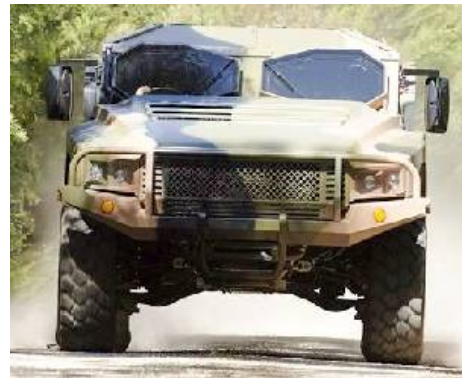
The Australian Government will purchase 1100 locally built Hawkei protected vehicles and over 1000 trailers to strengthen our defence force.