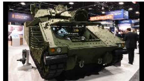
BAE Systems' Next Generation Bradley Fighting Vehicle demonstrator is debuting today at the Association of the United States Army (AUSA) annual meeting in Washington, D.C.