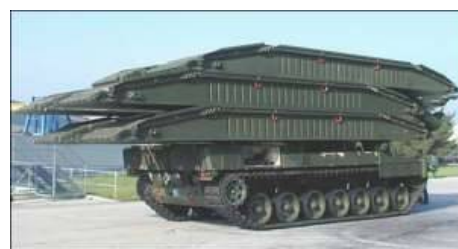
Munich/Koblenz -- The Federal Office of Bundeswehr Equipment (BAAINBw) and Krauss-Maffei Wegmann (KMW) have signed an agreement on the procurement of seven Leguan