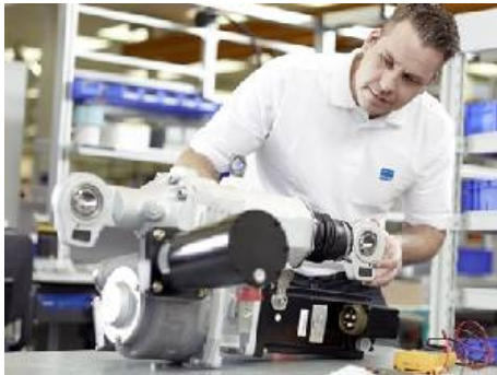
The Jenoptik Defense & Civil Systems division will deliver 126 electrical turret and weapon stabilization systems for the Leopard 2 tank.

Jenoptik is to supply 126 electric turret and weapon stabilization systems to the Polish company ZM Bumar Labedy S. A. as part of a modernization program for the Leopard 2 tank. The complete order amounts to 22 million euros and will be handled together with Polish sub-suppliers. Delivery will be made between 2017 and 2020. Jenoptik is the first large subcontractor after Rheinmetall Defence within the Polish project. The contract was signed at the Polish International Defense Industry Exhibition, MSPO, in Kielce.