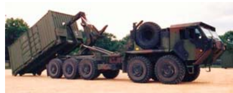
OSHKOSH, Wis., -- Oshkosh Truck Corporation announced that it has unveiled an unmanned version of its Palletized Load System (PLS) vehicle at the U.S. Army Tactical Wheeled Vehicle Component Technology Demonstrations in Yuma, Ariz. Showcasing the immediate application of the technology for the U.S. Army fleet, Oshkosh is demonstrating a real-world mission scenario as the driverless truck transports cargo between destinations seven miles apart in the Arizona desert.

The unmanned navigational kit being applied to the PLS was tested at the 2004 and 2005 DARPA Grand Challenge races, and has undergone additional testing in desert environments, similar to those in the Middle East. Oshkosh is partnered with Rockwell Collins and the University of Parma, Italy, on the development this unmanned navigational kit.