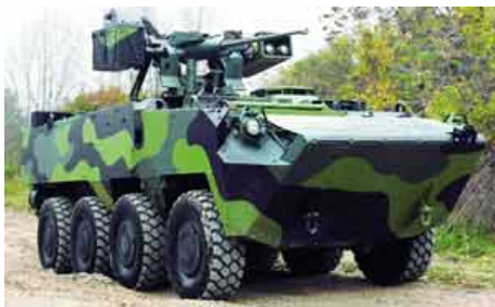
A special version equipped with a remote controlled weapon station (RCWS) cal. 30mm of Rafael.

The RCWS-30 is the most modern 30 mm turret increasing the capability and survivability of a modern high-mobility fighting vehicle. The armament of the RCWA-30 includes a 30mm ATK Mk44 automatic cannon, a launcher pod for two RAFAEL SPIKE-LR anti-tank/ multipurpose guided missiles, and a coaxial 7,62mm general-purpose machine gun. The system provides observation capabilities during day and night and accurate firing capabilities, aided by a stabilization system and an automatic tracker for fire-on-the-move capability.