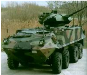
Dublin, Ireland - On December 20, 2005 the Irish Department of Defence (DoD) and MOWAG GmbH – a General Dynamics company – signed a contract for a further batch of 15 units of the PIRANHA IIIH 8x8, with a total value of close to 30 Million Euros.

After two contracts for the same vehicle between 1999 and 2002, this contract adds two new variants to the fleet of MOWAG vehicles operated by the Irish DoD.