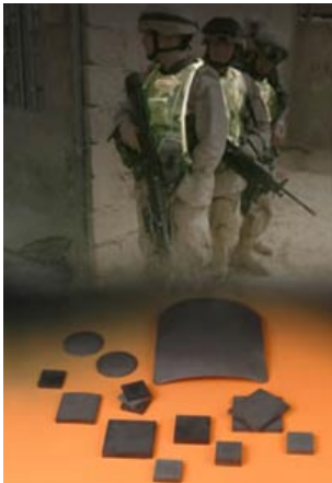
Haifa, -- RAFAEL Armament Development Authority Ltd. has received an order valued at $2.2M for ultra lightweight personal ceramic armor intended to protect the individual soldier on the modern battlefield.

Developed by RAFAEL, this unique armor is made of boron carbide, one of the hardest materials known and has the ability to defend against high velocity projectiles at a lower cost than that of its competitors.