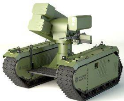
The leading European missile systems designer and producer MBDA and unmanned vehicles manufacturer Milrem Robotics will begin developing the world's first unmanned ground vehicle (UGV) specially designed for anti-tank purposes.

The joint project will feature the IMPACT (Integrated MMP Precision Attack Combat Turret) system from MBDA that will be integrated onto the THeMIS unmanned ground vehicle by Milrem Robotics.