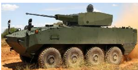
PLODIV (Bulgaria) -- General Dynamics European