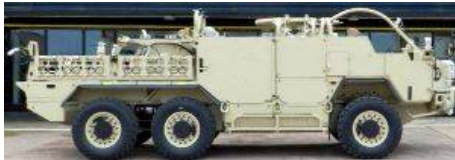
UK Special Forces vehicle designer and manufacturer, Supacat (part of SC Group), has today announced the recent delivery of the first production HMT Extenda vehicle to the Norwegian Armed Forces. The handover took place at Supacat's Devon facility on 30 May 2018.

Supacat signed a B23 million contract with The Norwegian Defence Material Agency (NDMA) to supply a new fleet of High Mobility Vehicles in May 2015. The award includes the provision of a comprehensive through-life support package. The first 'pre-series' vehicle was delivered in early 2017 followed by full fleet delivery taking place during 2018 and 2019.