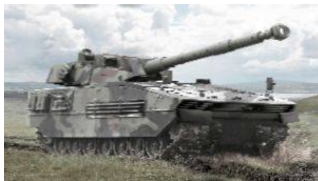
Otokar, the leading supplier of Turkish Land Forces, debuted its TULPAR Light Tank at Eurosatory 2018 in Paris, France.

Otokar, a Koç Group company, debuted its TULPAR Light Tank for the first time at Eurosatory 2018, Europe’s largest defense industry exhibition in Paris, France between June 11th and 15th. Within its wide product range Otokar will also display its ARMA,