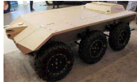
HORIBA MIRA – a world-leader in unmanned ground vehicle systems has displayed its state-of-the-art unmanned ground vehicle (UGV) platform, CENTAUR, at Eurosatory in Paris, France.

The UGV can be integrated with various payloads including the detection of improvised explosive devices, remote surveillance and soldier support.