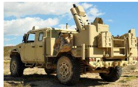
EXPAL, a benchmark in the design and manufacture of technologies and solutions in mortar systems, showcased the latest functions of the EIMOS system at its stand, which can be visited at Eurosatory 2018 until 15th June.