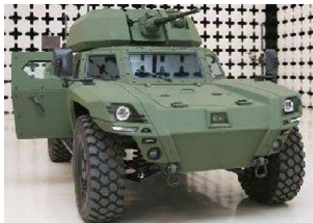
Turkish private defense company Otokar introduced the AKREP II first Turkish electric armored vehicle. The novelty will be exhibited at IDEF'19 Turkish defense exhibition, which will be held in May.