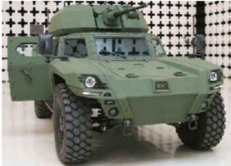
Turkish private defense company Otokar introduced the AKREP II first Turkish electric armored vehicle. The novelty will be exhibited at IDEF'19 Turkish defense exhibition, which will be held in May.