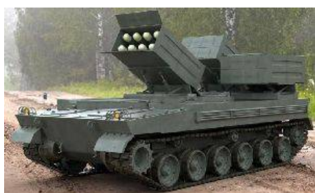
MBDA and PGZ have unveiled at MSPO 2019 a Tank Destroyer armed with the Brimstone precision strike missile.

PGZ Companies and MBDA also signed a statement of co-operation at MSPO to confirm readiness to co-operate on offering this solution to Poland and export markets, recognising the combination of MBDA's Brimstone missile with PGZ's armoured vehicle expertise offers the best solution for Poland's Tank Destroyer requirement from a military capability, sovereignty and industrial perspective.