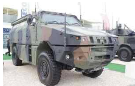
Iveco Defence Vehicles, a company of CNH Industrial N.V., announced today that it has been awarded a contract by the Dutch Ministry of Defence to provide 1275 medium multirole protected vehicles denominated “12kN”.