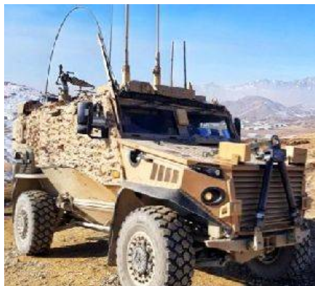
General Dynamics Land Systems–UK is showcasing its highly-adaptable Foxhound 4x4 vehicle at Defence and Security Equipment International (DSEI) 2019.

Since 2012, 400 Foxhound vehicles have been in-service with the British Army and have been deployed worldwide, including in Afghanistan and Iraq, offering exceptional mobility, ride and blast protection. Designed and built in the UK, Foxhound integrates highly survivable V-shaped hull technology and utilises a dismountable crew pod design for different roles, including the existing Foxhound Troop Carrier, a Weapons Mount Installation Kit (WMIK)-style Reconnaissance variant, a flat-bed Utility load carrier, and a Command and Control (C2) variant. The latest variant of the British Army Foxhound fleet enables the vehicle to undertake a Public Order role.