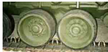
The wheels bearing the weight of a land vehicle onto the ground or its own tracks.