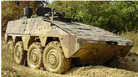
Krauss-Maffei Wegmann (KMW) welcomes the decision of the German parliament (Bundestag) in Berlin to procure 272 highly protected BOXER vehicles.

It has set with this decision an especially important procurement milestone towards a European-developed armored transport vehicle involving border-crossing production with the Dutch partner. The Dutch armed forces will procure 200 BOXER vehicles as well.