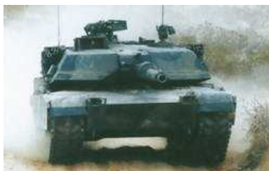
The U.S. Army Tank-Automotive and Armaments Command on May 4 awarded General Dynamics