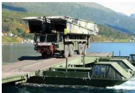
Krauss-Maffei Wegmann (KMW) has received a contract from the Norwegian Ministry of Defence for the upgrade of its LEGUAN bridgelayering systems.

A 9 Mio. EUR contract was recently signed by the Director of the Norwegian Defence Procurement