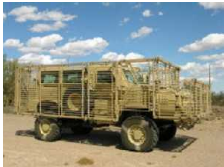
BAE Systems has installed the first two LROD(tm) rocket-propelled grenade (RPG) protection kits on U.S. Army RG31 and RG31A1 mine-protected vehicles.

LROD is a lightweight, modular bar-armor system composed of an aluminium alloy that provides protection against RPGs without compromising the operational capabilities of the vehicle. Weighing less than half of comparable steel designs, LROD bolts onto the vehicle without welding or cutting, and can be repaired in the field.