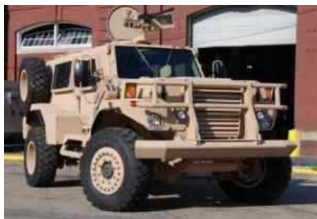
North Charleston, SC- Protected Vehicles, Inc. is pleased to announce development of its newest wheeled combat vehicle The Protector.

Designed to improve upon the shortcomings encountered by the current HMMWV in operational theatre during missions and patrols in Iraq and Afghanistan, The Protector offers advanced armor solutions to threats from both improvised explosive devices (IEDs) and the more recent and devastating explosively formed penetrators (EFP) utilized by the enemy. With a curb weight of only 14,000 pounds, The Protector offers improved safety from ballistics, IEDs and EFPs in a lighter package than the HMMWV. In addition to standard armor, The Protector is designed to accept the up-armor ShieldAll™, available exclusively from Protected Vehicles, Inc. This revolutionary next-generation composite armor material is not only a lighter, more capable and cost-effective armor solution to steel, but has also been repeatedly tested at U.S. Government facilities as a proven defense against deadly EFPs. As the threats on a new asymmetric battlefield continue to evolve, The Protector has arrived to mitigate risks, protect the war-fighters and accomplish the