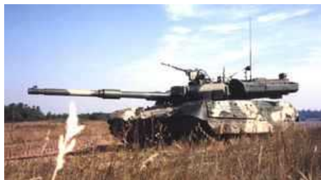
On 6 September 2007, SOE Kharkov Morozov Machine Building Design Bureau (SOE KMDB) celebrated its 80th jubilee.

Created on the basis of Kharkov steam-engine plant in 1927, the design group on tank development was gradually transformed into a separate high-capacity design-manufacturing enterprise creating armoured equipment. It has taken a key place in its field in the former USSR, and now in Ukraine. Among the developments of SOE KMDB a special place is occupied by such vehicles as the best tank of the Second World war – T-34, and a forefather of all the post Soviet main battle tanks – T-64.