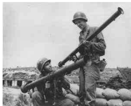
The bazooka is a man-portable anti-tank rocket launcher, made famous during World War II where it was one of the primary infantry anti-tank weapons used by the United States Armed Forces.