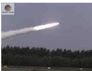
Live fire test of Rheinmetall Defence's Corect guidance module has confirmed its effectiveness in impressive fashion.

The new satellite-supported flight path guidance modules successfully guided two Corect-MLRS test rockets to a target 20 km away with compelling precision, compensating for a lateral error of approximately 300 m. This proves the technical and operational effectiveness of the Corect guidance module in conjunction with the Multiple Launch Rocket System, or MLRS.