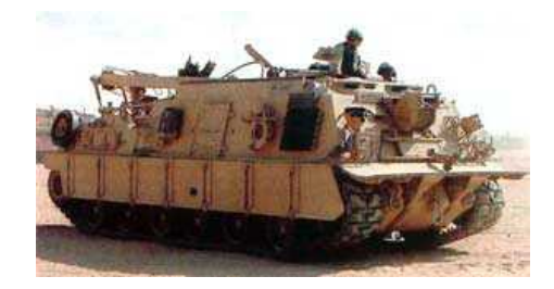
ANNISTON, Alabama -- BAE Systems has been awarded a US $19.7 million contract modification from U.S. Army's Anniston Army Depot to support, in partnership with the Depot, the reset to combat ready status of 57 Army-configured M88A1 medium recovery vehicles.

BAE Systems Awarded $19.7 Million Contract Modification To Support 57 M88A1 Medium Recovery Vehicles