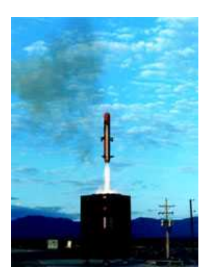
The Non-Line of Sight Launch System has completed the first of multiple summer tests at White Sands Missile Range, N.M., meeting all mission requirements and proving NLOS-LS is a weapon of choice for the Army of tomorrow.

The Future Combat System Technical Field Test, conducted in February and March, was the initiation of a summer of demanding developmental and operational tests for the Future Combat System command and control network, as well as a host of FCS related programs, to include Redstone Arsenal's NLOS-LS. The efforts of the project office paid off, as NLOS-LS reaped praise from users and evaluators alike during the test.