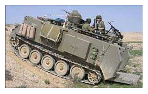
A new weapons system, which is controlled by a computer and is composed of 120 ml mortars, was recently developed for use by Ground Forces.

Keshet Weapons System Reaches the Infantry Brigade