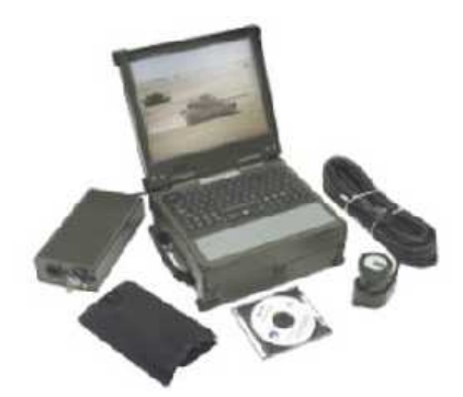
The Signal Corps of the United Arab Emirates and Thales have signed a major contract for the development and supply of ZAGIL, a theatre wide deployable Tactical Internet system.

Thales to supply a Deployable Tactical Internet to the Signal Corps of the United Arab Emirates