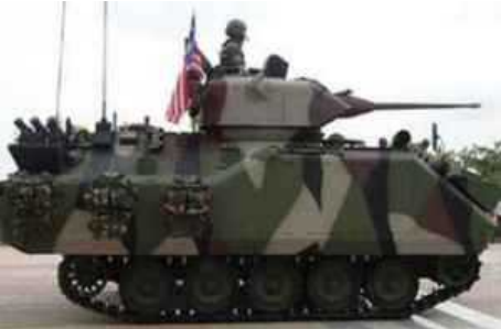
Thirty-seven defense companies from Turkey will participate in the 11th Defence Services Asia Exhibition and Conference (DSA 2008), which began yesterday in Kuala Lumpur, where more than 600 companies from 50 countries are expected to participate.

This year Turkish companies are expected to be the center of attention in Kuala Lumpur. FNSS Savunma Sistemleri (Defense Systems), one of the main Turkish companies at the event, has already signed armored vehicle contracts with Malaysia during DSA 2008 at the Putra World Trade Centre.