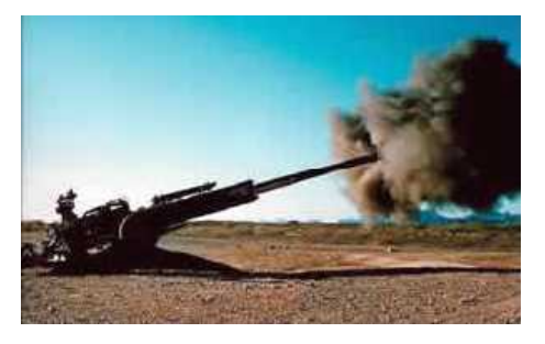
HATTIESBURG, Mississippi -- BAE Systems has received a new order from the U.S. Department of Defense for 87 additional M777A2 155mm towed howitzers, valued at $176 million. The order adds to the 589 M777A2 howitzers already on order for the U.S. armed forces, of which more than 300 have been delivered.

The 155mm towed howitzers purchased under this contract will be delivered in 2010.