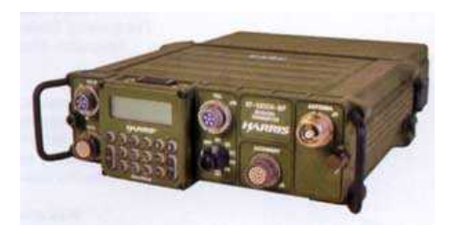
ROCHESTER, NY -- Harris Corporation, an international communications and information technology company, has been awarded a $96.7 million contract to continue upgrading U.S. Marine

Harris Corporation Wins $97 Million Contract to Accelerate U.S. Marine Corps Transition to Multiband JTRS-Approved Radio Soluti