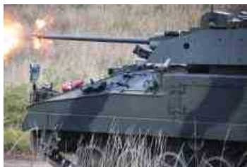
KIRKUDBRIGHT, Scotland -- British troops could get a major increase in firepower thanks to a revolutionary gun system and advanced turret destined for their armoured fighting vehicles.

Senior officials from the UK Ministry of Defence (MOD) and its French equivalent, the DGA, saw the system in action on a Warrior vehicle at the Kirkcudbright range in Scotland. The BAE Systems MTIP2 turret and its Cased Telescoped Armament System (CTAS) is already cleared to fire from a moving vehicle at a moving target.