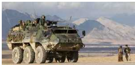
New material is selected by Ten Cate in vehicle up-armoring project for Dutch military in Afghanistan.

DSM Dyneema launched Dyneema BT10, its first commercially available product made from a novel, proprietary ballistic tape (BT) technology. The announcement was made jointly at the DVD exhibition, (Millbrook, UK), with Ten Cate Advanced Armour, who has selected Dyneema BT10 for armor upgrading on the Patria XA-188 APC commissioned by the Dutch DMO (Defensie Materieel Organisatie). The vehicles will be used by the Dutch military forces stationed in Afghanistan and delivery is expected to be completed by October 2009.