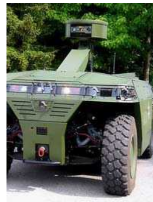
SUNNYVALE -- 2009—Real-Time Innovations (RTI), The Real-Time Middleware Experts, today announced that Base Ten Systems Electronics GmbH (Base10) has selected RTI Data Distribution Service for their unmanned ground-based vehicle (UGV) project.

When the German Ministry of Defense needed the expertise to develop a UGV for deployment in hazardous environments, Base 10 was the natural choice. Base 10 has over 30 years of experience in the use and adaptation of commercial electronics and microprocessor technology for military applications.