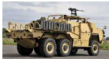
The new 'Coyote' Tactical Support Vehicle (Light), due to enter service later this year in support of operations in Afghanistan, received its official launch today by Quentin Davies, Minister, Defence Equipment and Services, at DVD, the annual event showcasing land equipment for the UK's Armed Forces.

Designed by Supacat, over 70 of the new Coyote