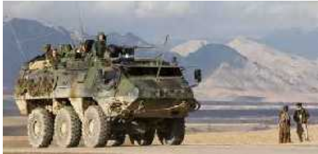
New material is selected by Ten Cate in vehicle up-armoring project for Dutch military in Afghanistan.

DSM Dyneema launched Dyneema BT10, its first commercially available product made from a novel, proprietary ballistic tape (BT) technology. The announcement was made jointly at the DVD exhibition, (Millbrook, UK), with Ten Cate Advanced Armour, who has selected Dyneema BT10 for armor upgrading on the Patria XA-188 APC commissioned by the Dutch DMO (Defensie Materieel Organisatie). The vehicles will be used by the Dutch military forces stationed in Afghanistan and delivery is expected to be completed by October 2009.