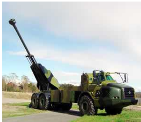
Akers Krutbruk has been selected to develop the protection system for Archer, the BAE Systems Bofors artillery system.

Akers Krutbruk has been selected to develop the protection system for Archer, the BAE Systems Bofors artillery system. The Swedish and Norwegian defence organizations have ordered the development of Archer. The process of developing the system is scheduled until 2010, with an option of delivery of a series planned for fall 2011.