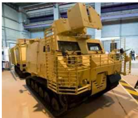
The first of 100 new Warthog vehicles, bought by the MOD to be used by British troops in Afghanistan's Green Zone, arrived in the UK yesterday to be prepared for operations.

Powered by a 7.2-litre engine that produces 350 brake horse power, the Warthog can wade through water while carrying up to 12 troops and offers improved levels of protection.