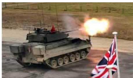
LEICESTER, United Kingdom -- British Army Warrior infantry fighting vehicles are set for a major boost in combat effectiveness by 2013 if a BAE Systems bid to upgrade the fleet is successful.

The bid, submitted a day before the 18 Nov deadline, is for the J1bn Warrior Capability Sustainment Programme (WCSP), which will provide the mainstay of the Infantry's frontline fleet in Afghanistan and future conflicts. It features a new turret and weapon system to increase firepower; a fully digital 'operating system' to improve fightability and survivability, and allow plug-and-play future upgrades; and a modular armour system for quick and simple adjustments to protect against ever-changing threats.