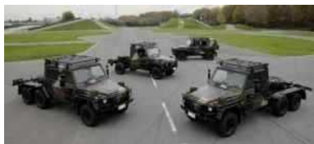
Graz, Austria/Melbourne -- Germany's Mercedes-Benz delivered on Oct. 29th 2009 the first of 1,200 specially made G - Class offroad vehicles to the Australian Army.

The new purpose-built cross-country vehicles will replace the Australian Defence Force's (ADF) existing tactical vehicle fleet. Their entry into the Australia's military is the result of a large-scale project by the ADF, internally coded as 'Land 121' but more commonly referred to as 'Project Overlander'.