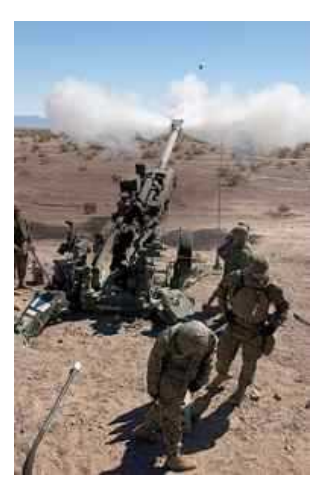
New Delhi, India -- Two of the world's most powerful howitzers will dominate the BAE Systems' presence at DefExpo in Delhi starting Feb 15th.

The BAE Systems FH77 B05 towed howitzer, and M777, the ultra light howitzer, will both be part of BAE Systems' biggest ever presence at DefExpo.