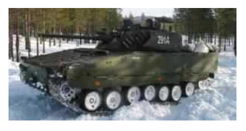
Saab has received an order for a training system to the Norwegian Armed Forces with a total value of MSEK 69 (euro6.76 million).

The order is part of the system for supporting the training of units and soldiers which has been operational for several years. The Norwegian Army is working to create a realistic training environment which offers an accurate picture of the reality that soldiers will face during missions where the reality is different to that in Nordic countries.