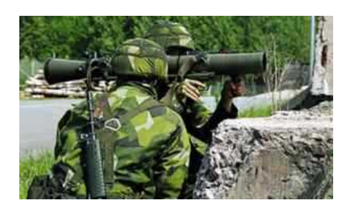
Greg Combet, Minister for Defence Personnel, Materiel and Science today announced improved firepower for the ADF with contracts being signed for a new anti-armour weapon capability.

"Defence has contracted SAAB Bofors Dynamics for the supply of the M3 84mm Carl Gustaf anti-armour support weapon," Mr Combet said.