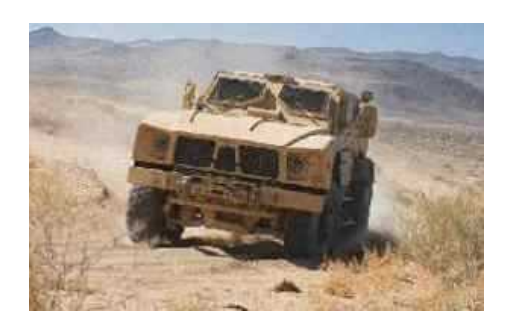
OSHKOSH, Wis. -- Oshkosh Defense, a division of Oshkosh Corporation, will be featuring the MRAP All-Terrain Vehicle (M-ATV) in its European debut at the International Armoured Vehicle Exhibition 2010, which is taking place Feb. 2-3 at the ExCel Centre in London.

Also on display at the Oshkosh booth (#268 in halls S4/S5) will be the company's protected, multi-role SandCat vehicle.