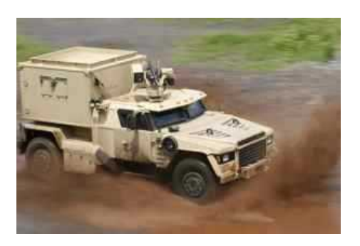
Owego, N.Y. -- Lockheed Martin has completed, ahead of schedule, production of its first two Joint Light Tactical Vehicles (JLTV), both new six-passenger Infantry Carrier variants.

The vehicles will be delivered to the U.S. Army and U.S. Marine Corps for a year-long testing period as part of the Technology Development (TD) phase of the JLTV program.