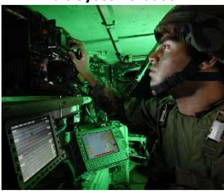
The following will be demonstrated in the Elbit Systems booth:

\_Dominator \& \_Integrated \_Infantry \_Combat \_System - Detects, Delivers,