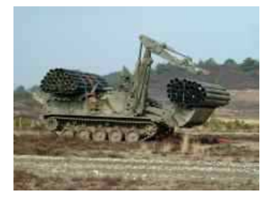
Newcastle, United Kingdom. -- The BAE Systems` programme to deliver 60 TERRIER™ vehicles to the British Army has taken two important steps