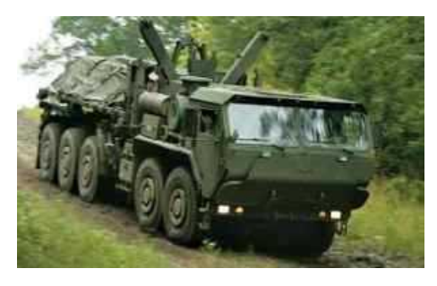
OSHKOSH, Wis. -- Oshkosh Corporation today announced that its Defense Division received a delivery order to an existing contract valued at more than $158 million from the U.S. Marine Corps Systems Command (MARCORSYSCOM) for more than 400 Logistics Vehicle System Replacements (LVSR).

The order brings the total number of LVSRs under contract to nearly 1,300. With this latest order, LVSR production and delivery is extended into July 2011. More than 385 MKR18 cargo variants will be produced under the order. The remaining variants will be MKR16 tractors.