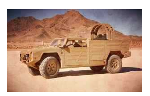
Ladson, S.C. -- Force Protection, Inc., a leading American designer, developer and manufacturer of survivability solutions, will debut the Joint All-Terrain Modular Mobility Asset (JAMMA) vehicle at the Association of the United States Army (AUSA) Institute of Land Warfare's Winter Symposium in Ft. Lauderdale, Fla., February 24-26, 2010 at booth #109.

JAMMA is the only armor-ready, four-occupant, hybrid, high-performance off-road vehicle that can be transported inside the V-22 Osprey helicopter. It is equipped to handle high speeds during extreme off-roading, on highways and through urban terrain. JAMMA is also capable of rapidly adapting to and being armored for specific mission profiles such as reconnaissance, rescue/recovery, med-evac and mobile security.