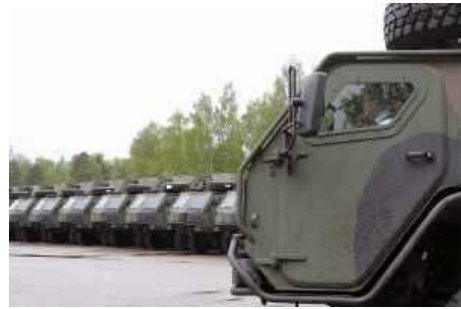
Delivered trucks are equipped with effective mine protection and feature a cabin of armour steel.

The Invitation to Tender (ITT) follows a recently awarded contract placed with Force Protection Europe by the UK MoD for the supply of two Ocelot light protected patrol vehicles.