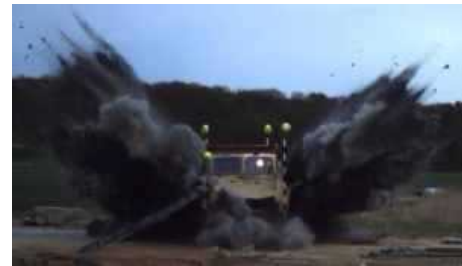
The Supacat SPV400, the all-British, all-new contender from Supacat to meet the UK Ministry of Defence's Light Protected Patrol Vehicle (LPPV) requirement was, this week, subjected to a second round of blast tests as part of the vehicle's development programme.

A number of blast tests were conducted to correlate development work and prove the upgrades and improvements incorporated into the SPV400 design since the first round of testing in December 2009.