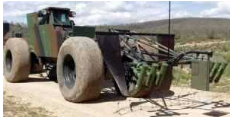
Development of SOUVIM 2, a mine path clearing system designed and manufactured by MBDA since 2008, has just been completed.

Two units of this land vehicle set will be delivered very shortly to the DGA, the French armament procurement agency and will undergo final qualification testing before delivery to the French Army. In line with the DGA's aim, the French Army will be ready to deploy this system on foreign theatres in 2010.