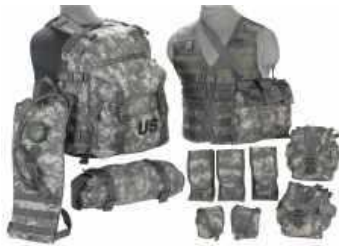
PHOENIX, Arizona -- BAE Systems has received a $10.7 million order from the U.S. Army Research, Development and Engineering Command (RDECOM) to manufacture and deliver more than 20,000 Modular Lightweight Load-Carrying Equipment (MOLLE) system sets in MultiCam® camouflage.

Designed to blend into virtually any environment, MultiCam is a single camouflage pattern that provides the wearer with needed concealment in one, basic set of gear. The MultiCam order includes core riflemen sets, large rucksack sets, as well as medic, grenadier, pistolman and SAW (Squad Automatic Weapon) Gunner pocket sets.