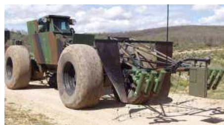
Development of SOUVIM 2, a mine path clearing system designed and manufactured by MBDA since 2008, has just been completed.

Two units of this land vehicle set will be delivered very shortly to the DGA, the French armament procurement agency and will undergo final qualification testing before delivery to the French Army. In line with the DGA's aim, the French Army will be ready to deploy this system on foreign theatres in 2010.