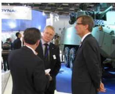
KONGSBERG's largest remote weapon station, the PROTECTOR Medium Caliber RWS, was presented for the first time to the European market at Eurosatory 2010.

One model was unveiled at General Dynamic's stand mounted on Mowag's new Piranha Class 5 wheeled armoured vehicle. The second model was showcased at the Finnish defence industry company Patria's stand, mounted on a Patria AMV 8x8 Armoured Wheeled Vehicle.