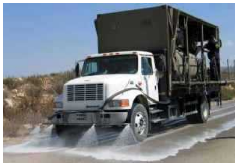
Israel -- Hatehof, a research, development, and production stalwart of armored vehicles for combat and terror threats, announces its new NBC (Nuclear, Biological, Chemical) division at this year's Eurosatory.

Following extensive research and development efforts, the company's new array of NBC vehicles and their accessories complement, now offers a comprehensive solution capable of handling an unconventional incident. The range of systems can be seen at Hatehof booth located Outdoors PE 6B stand F201.