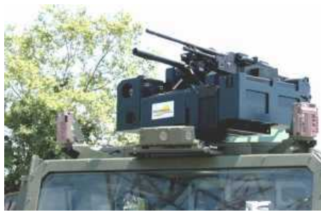
Haifa, Israel -- Elbit Systems Ltd. is introducing a new Dual Remote Weapon Station (DRWS) at the upcoming Eurosatory 2010.

The new Dual Remote Weapon Station (DRWS) is a derivative of Elbit Systems' RCWS-M, a medium-sized remotely-controlled weapon station, in serial production and qualified for service in the Austrian Army.