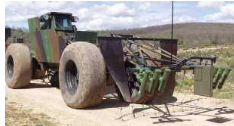
Development of SOUVIM 2, a mine path clearing system designed and manufactured by MBDA since 2008, has just been completed.

Two units of this land vehicle set will be delivered very shortly to the DGA, the French armament procurement agency and will undergo final qualification testing before delivery to the French Army. In line with the DGA's aim, the French Army will be ready to deploy this system on foreign theatres in 2010.