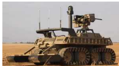
G-NIUS Unmanned Ground Systems Ltd., a jointly-owned company of Elbit Systems Ltd. and Israel Aerospace Industries Ltd., now unveils that its AvantGuard® UGCV was delivered to the IDF.

G-NIUS Unmanned Ground Systems Ltd., a jointly-owned company of Elbit Systems Ltd. (NASDAQ and TASE : ESLT) and Israel Aerospace Industries Ltd., now unveils that its AvantGuard® UGCV was delivered to the IDF.