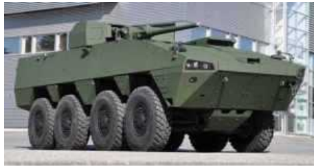
At the Eurosatory 2010 Patria presents the Patria AMV 8x8 Armoured Wheeled Vehicle together with the new KONGSBERG PROTECTOR Medium Calibre Remote Weapon Station (MC RWS) together with the KONGSBERG PROTECTOR Lite in a "Hunter-Killer" role.

In its "Nordic IFV –concept" Patria is combining the most modern combat proven armoured wheeled vehicle the Patria AMV 8x8 with a unique combination of the new KONGSBERG PROTECTOR Medium Calibre Remote Weapon Station (MC RWS) with a KONGSBERG PROTECTOR Lite in a "Hunter-Killer" role. The concept also features KONGSBERG Blue Force PROTECTOR, a near real-time battle management system distributing information on own and friendly positions in a network to reduce the risk for Blue-on-Blue incidents, as well as the Rheinmetall Defence Situational Awareness System (SAS) that provides 360° degree view. Together, with its main protection partner, IBD Deisenroth & G...kers Krutbruk Patria presents the next generation survivability concept applied on the Patria AMV, Armoured Modular Vehicle.