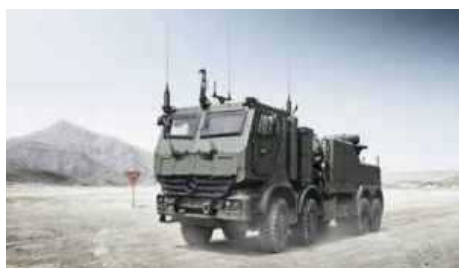
Mercedes-Benz will present 11 vehicles from its range of products with payloads between 0.5 and 110 tons for military customers at Stand B310 in the German Pavilion at EUROSATORY 2010 (June 14 to 18, 2010).

Mercedes-Benz will be celebrating four world debuts at EUROSATORY 2010. The all-wheel-drive Actros 4151 AK 8x8 Recovery is in a protection class that has never been offered before. The new recovery vehicle provides Level 4 ballistic protection and Level 4b mine protection according to STANAG 4569. The systems of the armored Actros 4151 AK 8x8 have been further optimized on the basis of many years of experience.