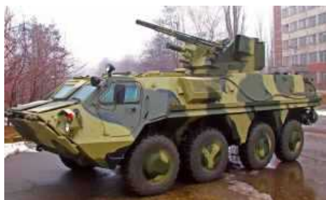
General Designer of the SOE KMDB Lt Gen Mykhailo