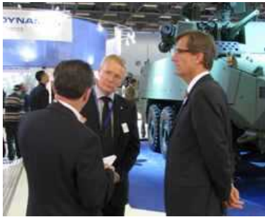
KONGSBERG's largest remote weapon station, the PROTECTOR Medium Caliber RWS, was presented for the first time to the European market at Eurosatory 2010.

One model was unveiled at General Dynamic's stand mounted on Mowag's new Piranha Class 5 wheeled armoured vehicle. The second model was showcased at the Finnish defence industry company Patria's stand, mounted on a Patria AMV 8x8 Armoured Wheeled Vehicle.