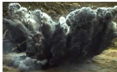
The all-new, all-British Supacat SPV400, which is competing to win a UK Ministry of Defence BJ200 million Urgent Operational Requirement for a Light Protected Patrol Vehicle (LPPV) to replace the Snatch Land Rover, last week completed a fourth round of blast tests.

These tests were conducted despite the LPPV bid having already been submitted to the MoD.