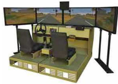
Daytona Beach, Fla. – Raydon Corp. was awarded on July 9 a $36,355,550 firm-fixed-price contract.

This contract is for 11 Mine Resistant Ambush Protected Vehicle virtual trainers for the Army National Guard. Work is to be performed in Daytona Beach, Fla., with an estimated completion date of Nov. 30, 2011. Over 50 bids were solicited with one bid received. National Guard Bureau, ZC-AQ, Arlington, Va., is the contracting activity (W9133L-10-F-0130).