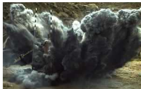
The all-new, all-British Supacat SPV400, which is competing to win a UK Ministry of Defence J200 million Urgent Operational Requirement for a Light Protected Patrol Vehicle (LPPV) to replace the Snatch Land Rover, last week completed a fourth round of blast tests.

These tests were conducted despite the LPPV bid having already been submitted to the MoD.