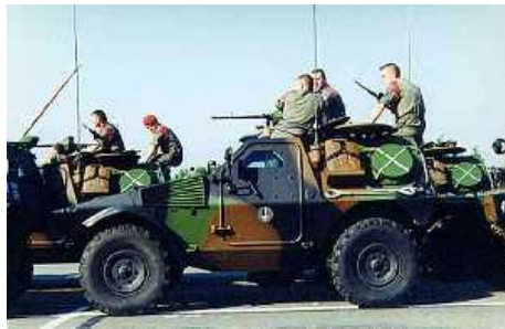
NEWTOWN, Conn. -- Serial production of the M11 Vehicule Blinde Leger (VBL) is ongoing, primarily for French Army procurement.

In 2002, the French Army placed a follow-on order for 500 vehicles. In April 2006, the French Army ordered an additional 91 VBL2L reconnaissance vehicles. The French Army VBL procurement objective now exceeds 1,600 vehicles.