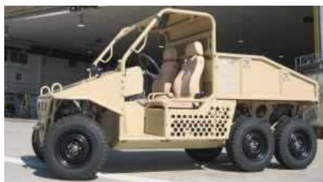
Alexandria, Virginia -- The LASSO® (Land, Air & Sea Special Operations) vehicle is the result of thousands of hours of research, engineering, design and testing by VSE Corporation.

What sets this compact, all-terrain vehicle apart is its true, full-time, six-wheel drive with a fully independent suspension, 9-inches of suspension travel, 12-inches of ground clearance and a payload capacity of 3,000 pounds--allowing for high capacity load carrying in hard-to-travel environments.