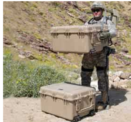
ORLANDO -- Lockheed Martin has received a $1.1 million contract from the U.S. Army Natick Soldier Center for test and evaluation of its next-generation HULC™ advanced robotic exoskeleton, designed to augment Soldiers' strength and endurance, as well as reduce load carriage injuries.

Under this contract, the U.S. Army will test Lockheed Martin's advanced ruggedized HULC design. The upgraded HULC system includes optimized control software, extended battery life and human factors improvements for quicker and easier sizing to each user. Lockheed Martin is also exploring exoskeleton designs to support industrial and medical applications.