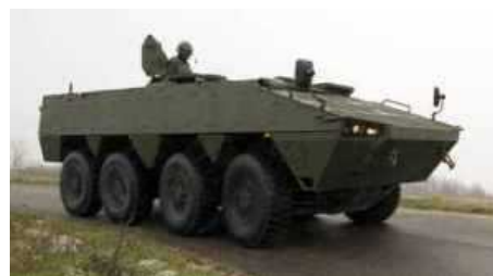
Patria and the Ministry of Defence (MoD) of the Republic of Croatia signed an Amendment related to the manufacturing and delivery contract of 126 Patria AMV 8x8 wheeled armoured vehicles on July 2010.

The negotiations were started on the Croatian MoD's initiative due to the financial reasons.