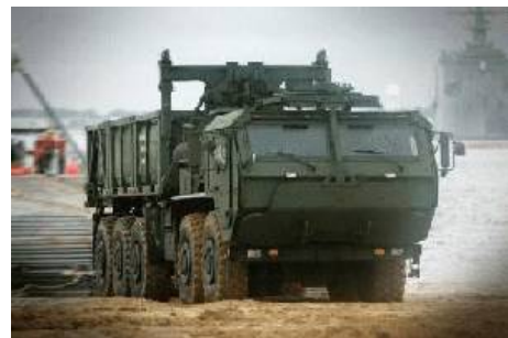
OSHKOSH, Wis. -- Oshkosh Defense, a division of Oshkosh Corporation, will supply the U.S. Marine Corps with more than 100 Logistics Vehicle System Replacement (LVSRC) Cargo Variants and 120 enhanced protection kits following an order from the Marine Corps Systems Command (MARCORSYSCOM).