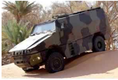
Rome -- Iveco Defence Vehicles announces that on December 20th, 2010 the Italian Army placed order for a batch of 12 MPV in the Ambulance version (named VTMM Ambulance by the Italian Army) to be delivered between 2011 and 2012.

The Ambulance version of the MPV-VTMM has been developed on the basis of the MPV 4x4 platform increasing the volumes and ergonomics. The vehicle is equipped with two stretchers and will transport a crew of 4 people: driver, commander, medical officer, nurse. A suitable system for loading stretchers has been developed. The vehicle will be equipped with NBC protection system.