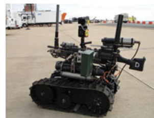
As casualties continue to mount in Iraq and Afghanistan, the Defense Department is seizing on technology to protect combat soldiers from snipers, mortars and roadside bombs. As of early-June, more than 1,660 U.S. personnel had died in Iraq, and 12,762 had been wounded. In the wider war on