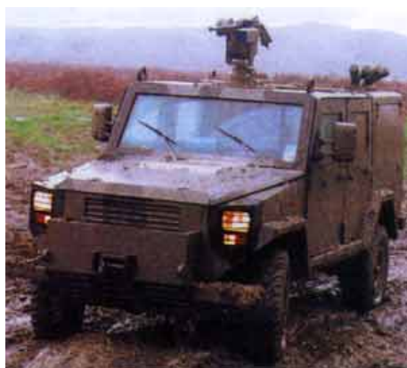
South Africa's leading designer and manufacturer of armoured vehicles, BAE Systems Land Systems OMC, has had to rearrange its production facilities to meet the needs created by its recent hat-trick of significant international orders for its products.