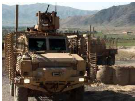
The Army is marking the manufacture of the 10,000th M153 Common Remotely Operated Weapons Station, known as CROWS.

The CROWS system allows a weapon such as the M2 .50-caliber machine gun to be mounted atop a vehicle, such as the Humvee, and be targeted and fired remotely from inside the vehicle. This allows a Soldier operator to stay safely inside the vehicle.