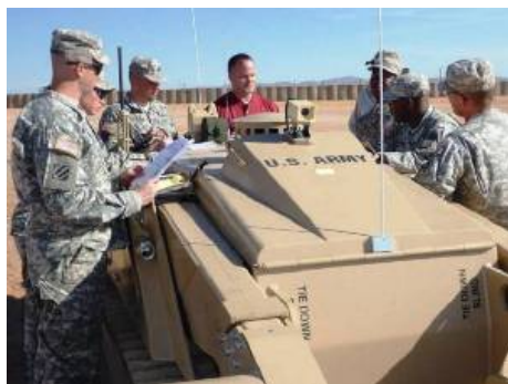
Tripping improvised explosive devices and unexploded ordnance in a controlled way to avoid Soldier injury has become an automated process now for Soldiers here and at Fort Bliss, Texas.

Soldiers are now training on the M160 MV4 DO-KING, a remote-controlled, tracked mine clearance system to trip hidden IEDs, UXOs and anti-personnel mines. By sending the system out to look for explosive dangers, Soldiers can clear a route without putting themselves in danger.