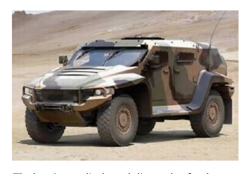
Thales Australia has delivered a further two Hawkei vehicles to the Defence Materiel Organisation on schedule.

The handover of the two Reconnaissance variants under Stage 2 of the Manufactured and Supported in Australia option of Land 121 Phase 4 means that all six vehicles are now with the Department of Defence for testing. All vehicle delivery milestones have been met on schedule.