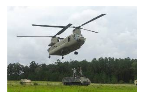
The Army's fiscal year 2014 Equipment Modernization Plan, now working its way through Congress, prioritizes equipping warfighters in Afghanistan while simultaneously preparing for an uncertain future.

Programs in the modernization strategy are grouped within ten "portfolios," but some of those programs the Army has called out as being priorities for the service.