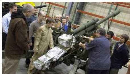
The Canadian Royal Army has enlisted the help of Picatinny engineers to evaluate the life-span of their World War II-era C3 Howitzer.