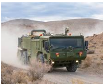
Oshkosh exhibiting Marine Corps' new fire fighting vehicle this week at Marine West

OSHKOSH, Wis. -- Oshkosh Defense, a division of Oshkosh Corporation, has delivered three Oshkosh P-19 Replacement Aircraft Rescue and Fire Fighting (ARFF) vehicle prototypes to the U.S. Marine Corps to undergo testing.