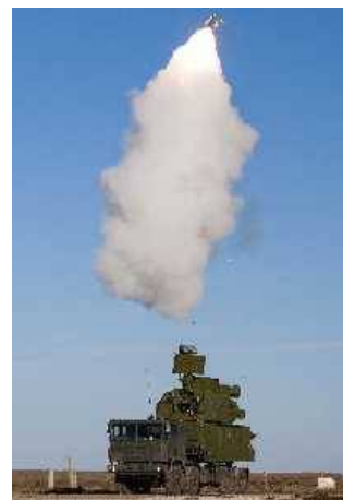
JSC Izhevsk Electromechanical Plant Kupol (Izhevsk) being a part of Air Defence Concern Almaz-Antey will present on International land and naval security system exhibition DEFEXPO INDIA-2014 unique exhibit - full-scale specimen of modular SAMS TOR-M2KM on motor chassis TATA.