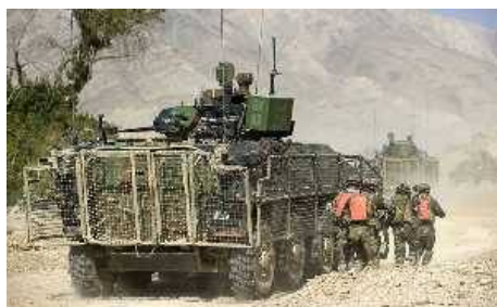
Versailles -- The Nexter Group has today signed the Support in Service contract for the VBCI armored infantry combat vehicle, at a ceremony held in Satory.

Fostering added force protection and maximum operational effectiveness, the trucks will also feature state-of-the-art communications and command technology as well as a remotely operated weapon station mounted to the roof of the cab for an integral self-defence capability.