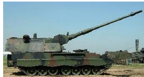
Sagem (Safran) has signed a contract with German manufacturer KMW (Krauss Maffei Wegmann) to integrate its SIGMA 30 navigation and pointing system on all PzH 2000 tracked artillery systems acquired by Qatar.

This contract, which comes in addition to the support contracts for LECLERC and CAESAR® fleets, confirms the position of Nexter as a major partner of the French Army.