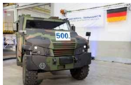
KAISERSLAUTERN -- the 500th EAGLE Command and Function Vehicle from General Dynamics European Land Systems was ceremonially delivered to the Bundeswehr.

On 4 April, approximately 100 invited representatives from the government and industry joined to celebrate the