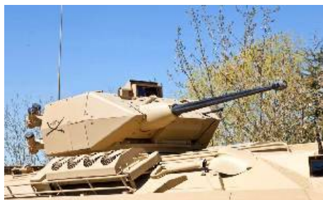
FNSS’ Brand New SABER 25mm One Man Turret successfully completes firing qualification tests on FNSS PARS 8x8 Infantry Fighting Vehicle.

SABER is a new generation one - man turret that can be deployed on wheeled and tracked armored vehicles and designed by taking the modern combat conditions