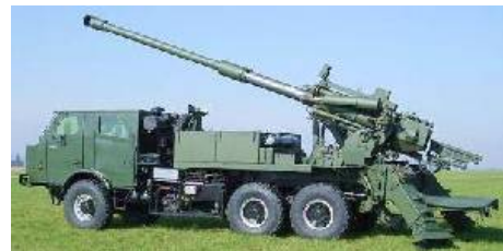
HAIFA, Israel -- Elbit Systems Ltd. announced that it was awarded an approximately $27 million contract for the supply of command and control systems and ATMOS long-range artillery systems to an Asia-Pacific country. This contract is a follow-on contract for this customer and will be performed over a three-year period.

The contract calls for the supply of a complete solution for an artillery unit, including self- propelled artillery, command stations, forward observation stations and target acquisition systems, as well as command and control systems, in an integrative solution to connect all systems. The solution, mounted on various wheeled - platforms, enhances mission flexibility, reaction speed and survivability of both the crew and the system.