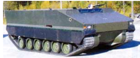
SEP T2 Land Systems Hagglunds has taken an important step in the development of SEP, the Swedish military vehicle of tomorrow.