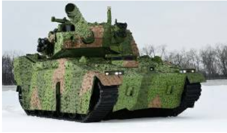
BAE Systems submits proposal for the U.S. Army's Mobile Protected Firepower program

BAE Systems has submitted its proposal to the U.S. Army to build and test the Mobile Protected Firepower (MPF) vehicle for use by the Infantry Brigade Combat Team (IBCT).