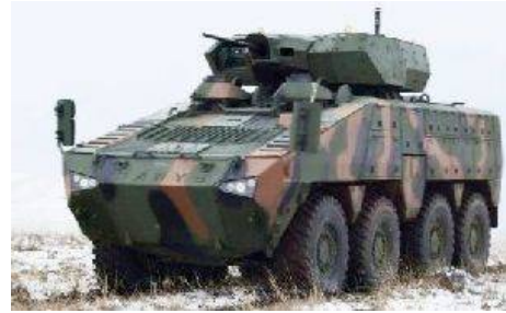
Paramount Group, the African-based global defence and aerospace company, and its joint venture in Kazakhstan, Kazakhstan Paramount Engineering (KPE), announced that the Ministry of Defence of Kazakhstan is in the final stages of the evaluation of the Barys 8x8 combat vehicle ahead of acceptance into service by the country's armed forces.

The Barys (Snow Leopard in the Kazakh language) which is based on Paramount Group's Mbombe 8 represents the pinnacle of land system technologies and was developed to meet the increasing demand for multi-role, high mobility and mine-hardened platforms.