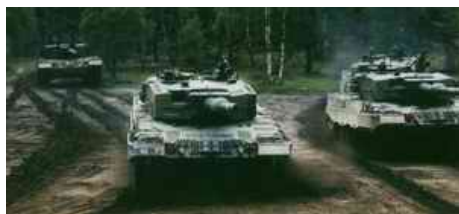
Turkey is considering an acquisition of 350 ex-German Army Leopard-2 MBTs. The Turkish team visited Germany at the beginning of September to inspect the vehicles.

According to the Shpigel magazine, Turkey is currently negotiating the price and delivery schedule. There is also a requirement to repair and retrofit all vehicles intended for export.