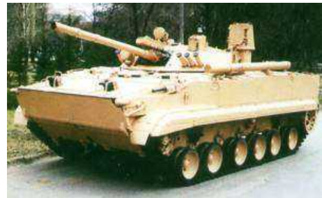
An infantry fighting vehicle (IFV, also known as mechanized infantry combat vehicle, MICV) is a type of armoured fighting vehicle (AFV) used to carry infantry into battle and provide fire support for them.

IFVs are similar to armoured personnel carriers (APCs), designed to transport five to ten infantrymen and their equipment. They are differentiated from APCs ("battle taxis") by their enhanced armament, allowing them to give direct-fire support during an assault, firing ports, allowing the infantry to fire personal weapons while mounted, and usually improved armour. They are typically armed with an autocannon of 20 to 40 mm caliber, 7.62 mm machine gun and possibly with ATGMs and/or AAMs. IFVs are usually tracked, but some wheeled vehicles fall into this category, too. IFVs are mostly much less heavily armed and armoured than Main Battle Tanks (MBTs), but they sometimes carry heavy missiles, such as the NATO 'TOW' missile and Soviet 'Spigot' which offer a significant threat to tanks.