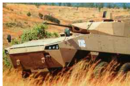
The United Arab Emirates' Armed Forces have ordered Patria AMV 8x8 armoured wheeled vehicles.