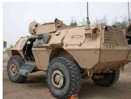
New Orleans, LA. -- Textron Marine & Land Systems (TM&LS) has been awarded a contract modification for $228 million to build an additional 329 M1117