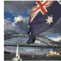
Acquisitions will provide a strong regional presence in Canberra, Melbourne, Sydney, Brisbane and Adelaide.

QinetiQ Group plc, an international defence and security technology company, announces today that it has signed agreements to purchase two Australian defence consulting businesses, Ball Solutions Group Pty Ltd and Novare Services Pty Ltd. These acquisitions are being acquired for a total cash consideration of A$20 million and are subject to regulatory approval. They represent QinetiQ's first investment in Australia and provide the company with a presence of 185 staff located in Canberra, Sydney, Melbourne, Brisbane and Adelaide.